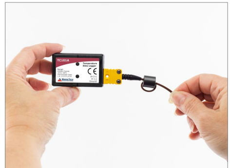
Step 5: Connect the thermocouple to the TC101A and use as normal