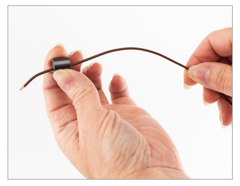
Step 1: String the ferrite core onto the thermocouple

Using the TC101A with an external probe routed through the ferrite core twice, the TC101A tested against RTCA/DO-160G for Emission of Radio Frequency Energy with satisfactory results.